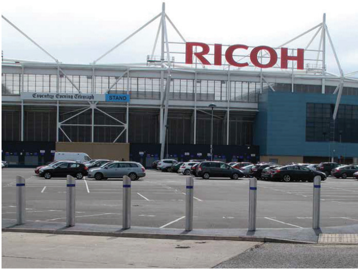
'Shallow mount foundation... Only 200mm deep single removable bollard!'