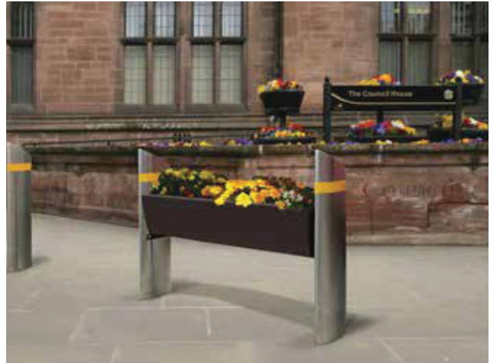
Supamaxx offer a selection of shrouds and street furniture. Details available on request.