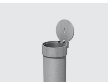
Hinge Cover Plate